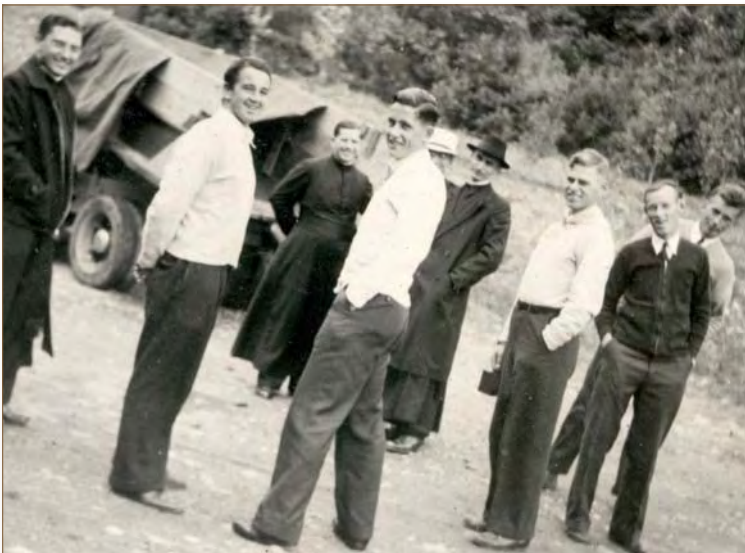
Belated vocations with faculty in 1939.