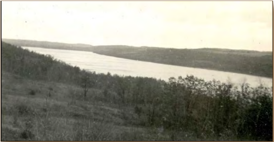
A view of Hemlock Lake from the vineyard.