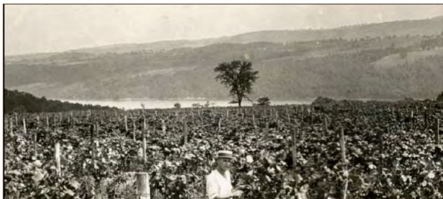
Vineyards on bishop's farm in the 1920s.

In 1929 the U.S. government gave permission to the Society to destroy what wine remained since most of it had already turned to vinegar and could not even be sold for enough money as vinegar to cover transportation costs. This helped the Society to avoid paying taxes on wine that was really vinegar. 13