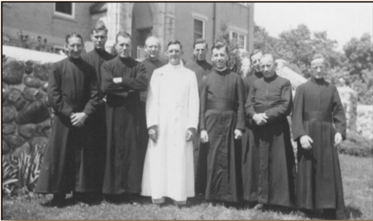
Some of the Brothers of Conesus.