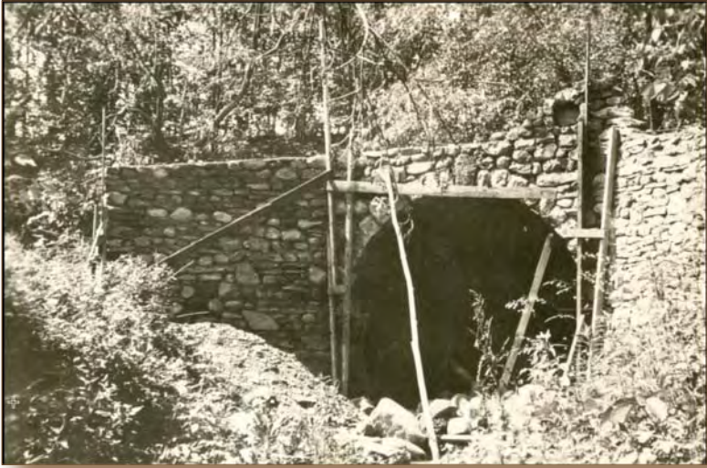
Repairs being made on the grottoes.

for alcoholics at Conesus and received approval, according to local newspapers. 68