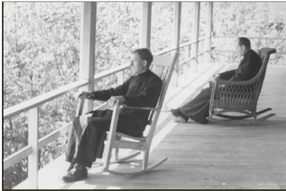
SVDs relaxing on the bishop's veranda.

Thirdly, there was no trained wine-maker available. The Diocese's own operations had been snarled on this thorn, a fact that ought to have raised a red flag and taught the Society a lesson.