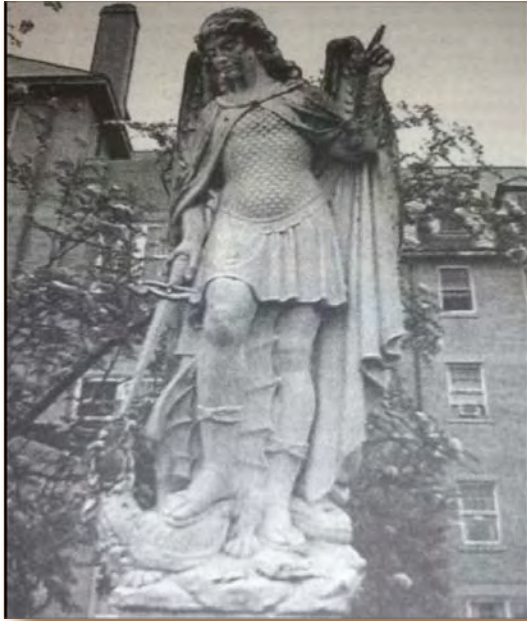
The Statue of St. Michael the Archangel.