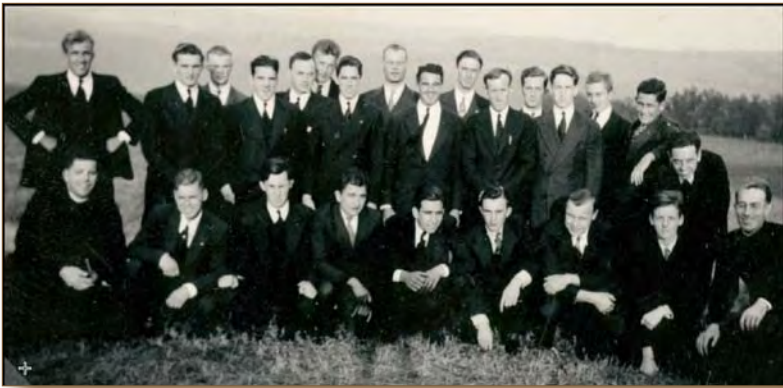
Seminarians and prefects ca. 1940.