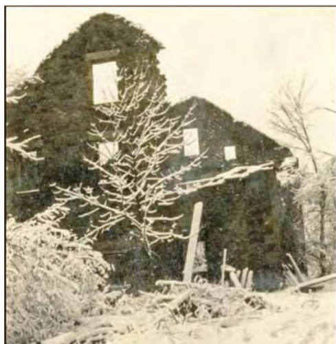
Ruins of the bishop's house.