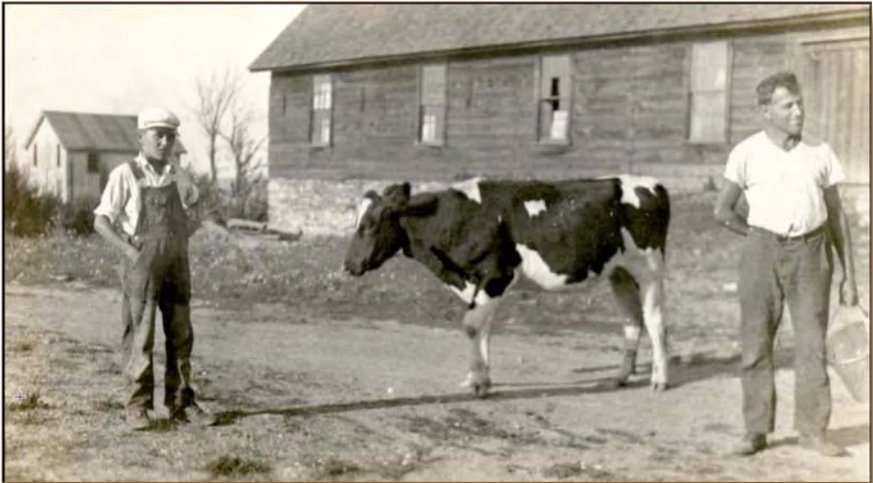
Workers on the bishop's farm.