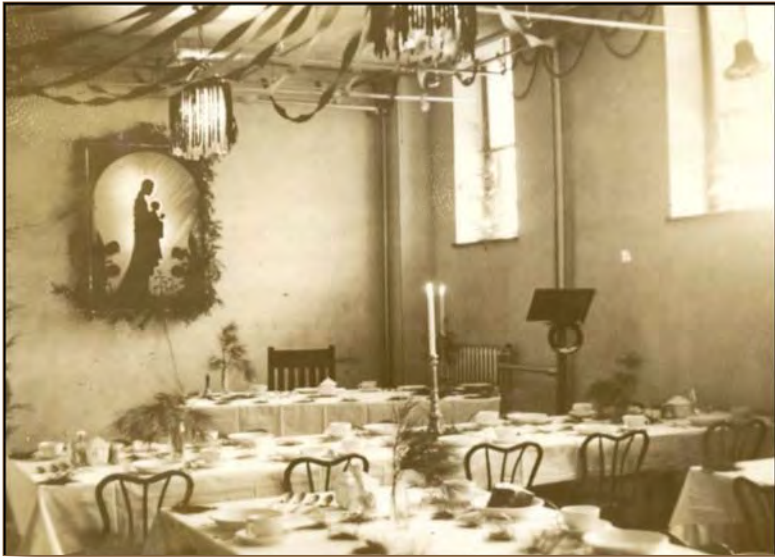
The community dining room.