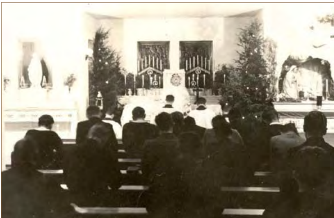
Conesus Chapel at Christmas in the late 1930s.