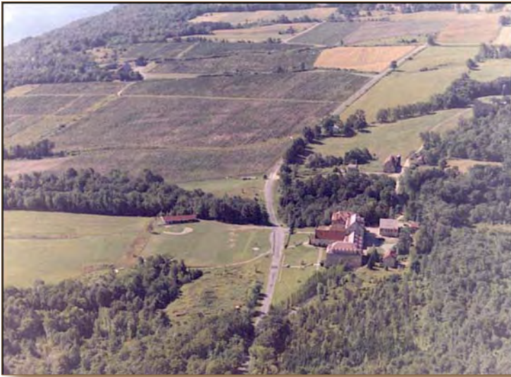
Aerial view of St. Michael Mission.

We are always beset with the secret little thought that maybe we shall sometime in the future be again looking for just such a place, so that we think the time has come for us to set up some form of ministry in the service of the Church. With some remodeling of the school building, and the refurbishing of the grottos and shrine, we think we can make a real contribution to the religious, educational and liturgical aims of the Holy Year with its mission theme of Evangelization. 59