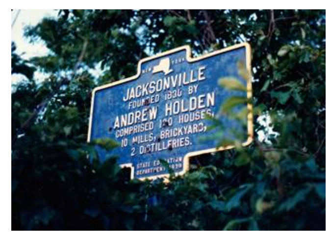
1 The Landmark sign erect at Jacksonville in 1939.

From the publication "Livonia History, 1989"